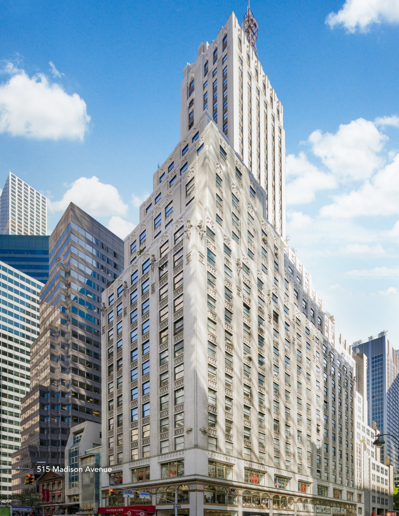
515 Madison Avenue