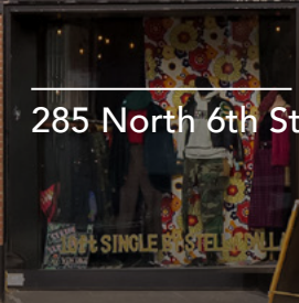
285 North 6th Street, Williamsburg, Brooklyn