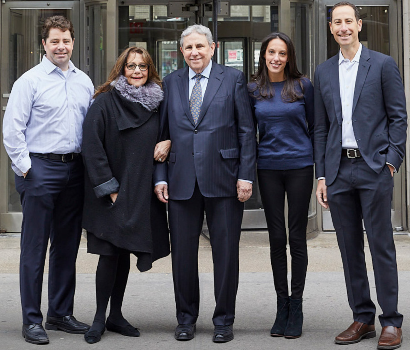
GFP Real Estate Principals The Gural Family